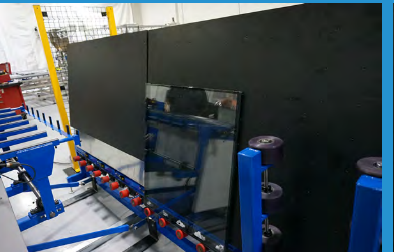
Unit loading on cart