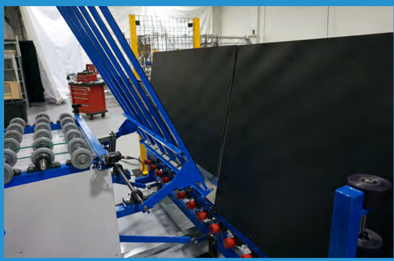
Unit advances to cart loading