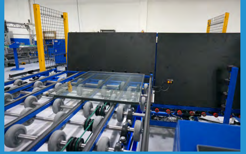
Unit moved to vertical